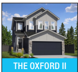
THE OXFORD II