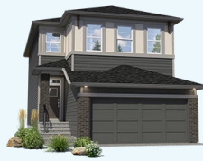
THE OXFORD II