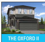
THE OXFORD II