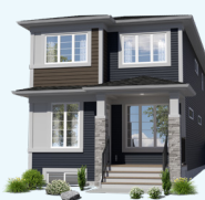
THE ROWAN II