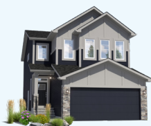
SHOWHOME THE OXFORD II