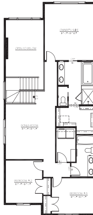
UPPER 1301 SQ.FT