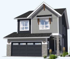
SHOWHOME THE HARRINGTON

Showhome hours: MON - THURS: 2 - 8PM FRI: Closed SAT - SUN: 12 - 5PM