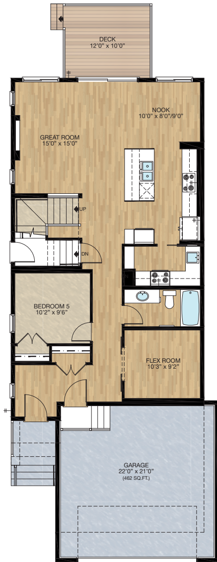
MAIN 1157 SQ.FT.